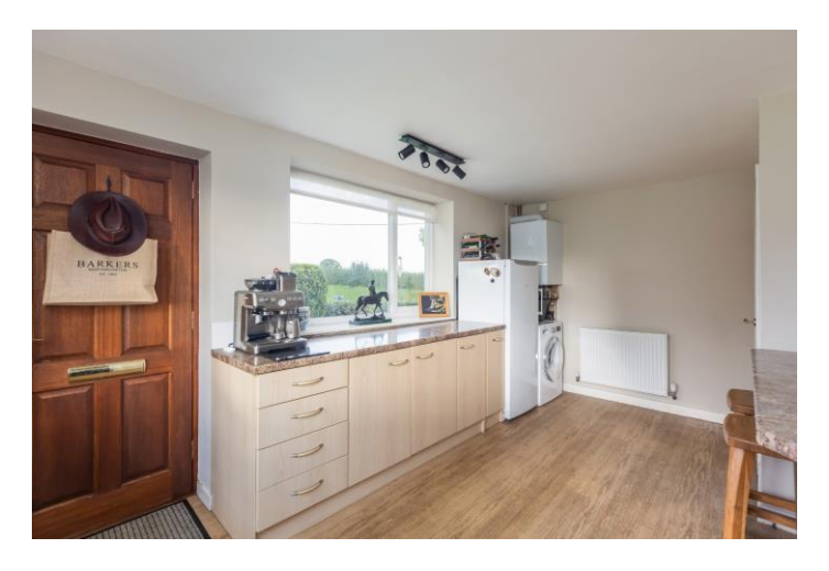
DINING ROOM/BEDROOM FOUR 3.60 m (11'10") x 3.60 m (11'10") Casement window to the front elevation. Radiator.