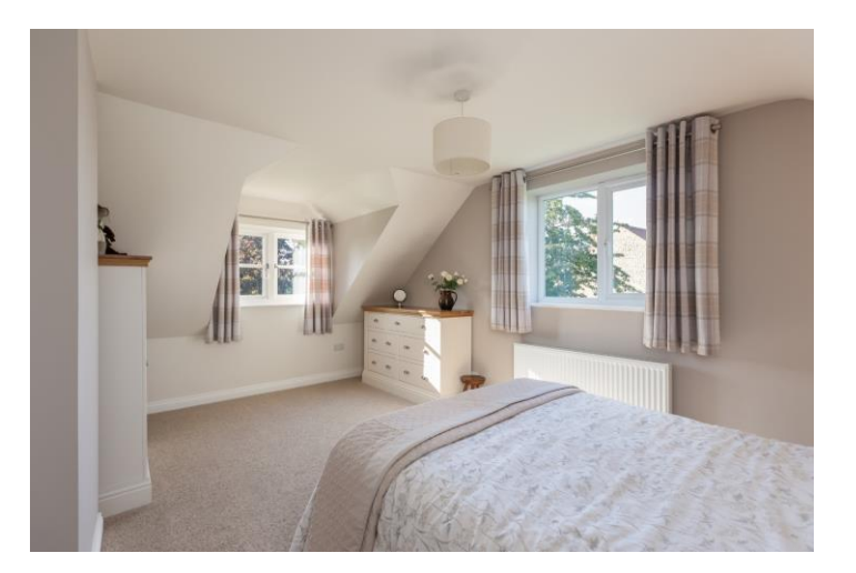
BEDROOM THREE 3.12 m (10'3") x 2.30 m (7'7") Casement window to the rear. Radiator. Eaves storage.