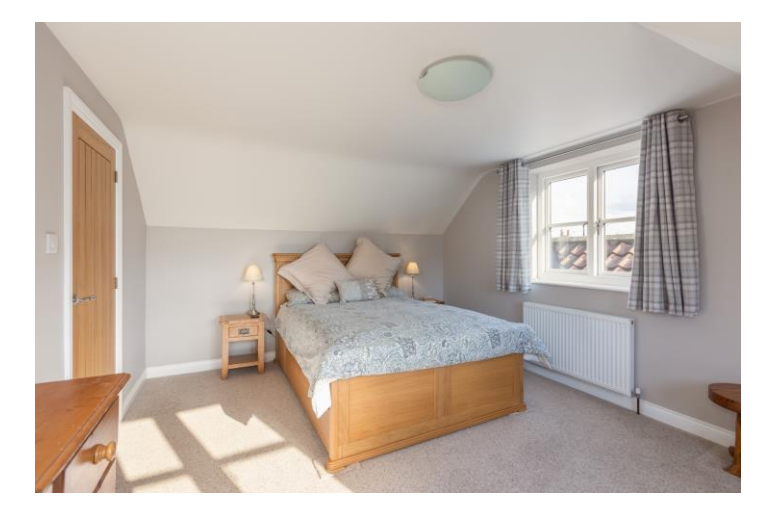
BEDROOM TWO 5.00 m (16'5") x 3.30 m (10'10") Casement windows to the side and rear. Radiator. Eaves storage. Television point.